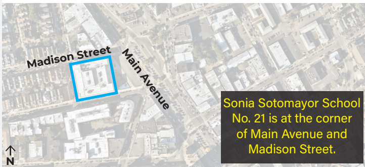
Sonia Sotomayor School No. 21 is at the corner of Main Avenue and Madison Street.